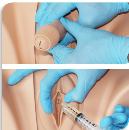
Accurate anatomical modelling