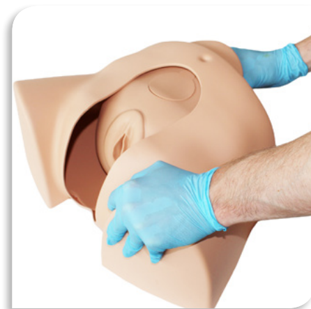
Easily interchangeable units