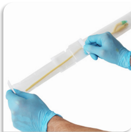
Aseptic catheterisation technique